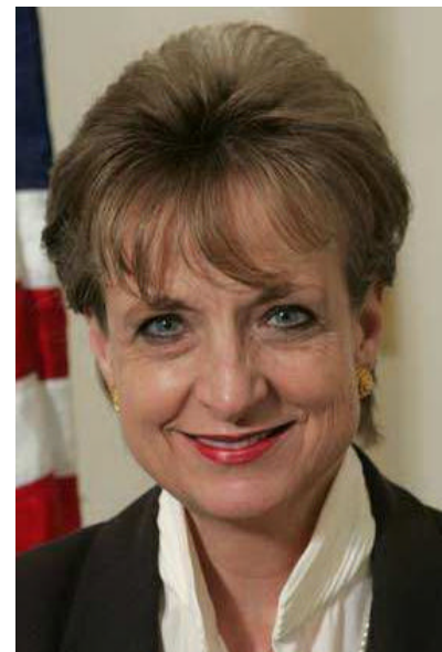
Supreme Court Chief Justice nominee Harriet E. Miers