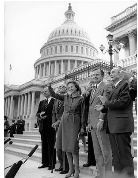
Supreme Court Justice Sandra Day O'Connor, on the Capital steps with President George Bush.