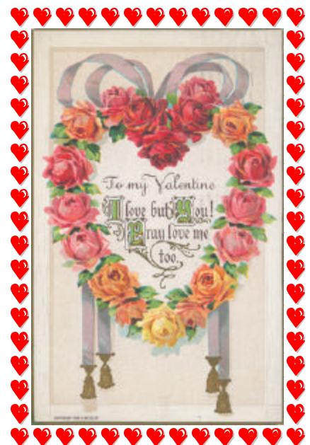
Valentine almost 100 years old